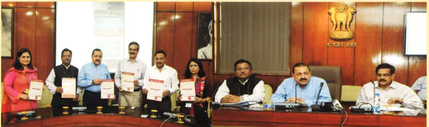
Hon'ble MoS(PP), Dr Jitendra Singh with the senior officers of DARPG and DoPT

The citizen can view the status any time - anywhere using the mobile App